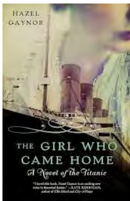
The Girl Who Came Home Hazel Gaynor

A voyage across the ocean becomes the odyssey of a lifetime for a young Irish woman. . . . Ireland, 1912 . . . Fourteen members of a small village set sail on RMS Titanic , hoping to find a better life in America. For seventeen-year-old Maggie Murphy, the journey is bittersweet. Though her future lies in an unknown new place, her heart remains in Ireland with Séamus, the sweetheart she left behind. When disaster strikes, Maggie is one of the few passengers in steerage to survive. Waking up alone in a New York hospital, she vows never to speak of the terror and panic of that fateful night again. Chicago, 1982 . . . Adrift after the death of her father, Grace Butler struggles to decide what comes next. When her great-grandmother Maggie shares the painful secret about the Titanic that she's harbored for almost a lifetime, the revelation gives Grace new direction—and leads both her and Maggie to unexpected reunions with those they thought lost long ago.